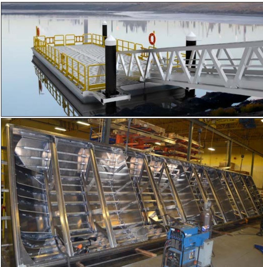
Figure 3. Top: Rendering of aluminum barge MAADI designed and built in October 2012. 5083 plate was used for the hull of the structure during the construction process and marine bulbs were extruded from 6061 T6 alloy. Bottom: The internal structure of the port side of the barge is shown. The structural arrangement sustains the pressure of one meter of ice thickness.

For the design of aluminum bridge structures using one of these general standards for aluminum structure design, engineers might consider using a general standard for calculating structural resistance, along with appropriate bridge